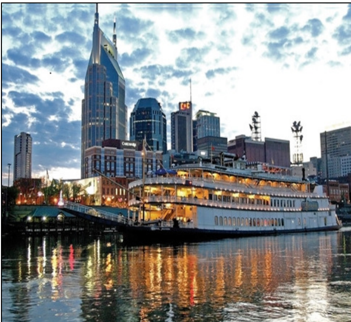
General Jackson Showboat in Nashville