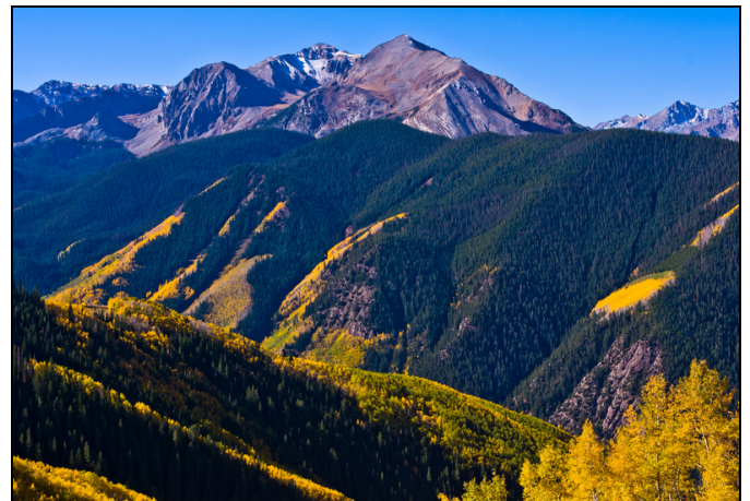
Enjoy Foliage drives through the Rockies