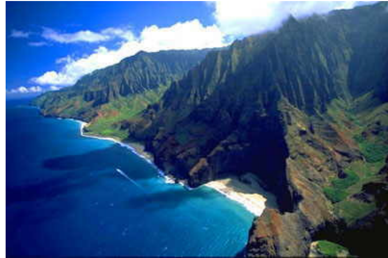
NaPali Coast in Kauai

Airfare will be arranged by Webb Tours as people register.