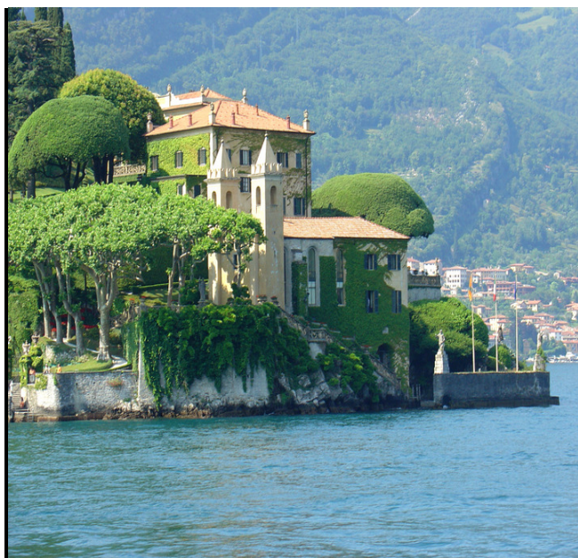
Stunning Lake Como in Northern Italy

*The above prices do not include international airfare and air taxes. Air will be reserved in early 2012. We anticipate the airfare to be $1,200-$1,350 + air tax.