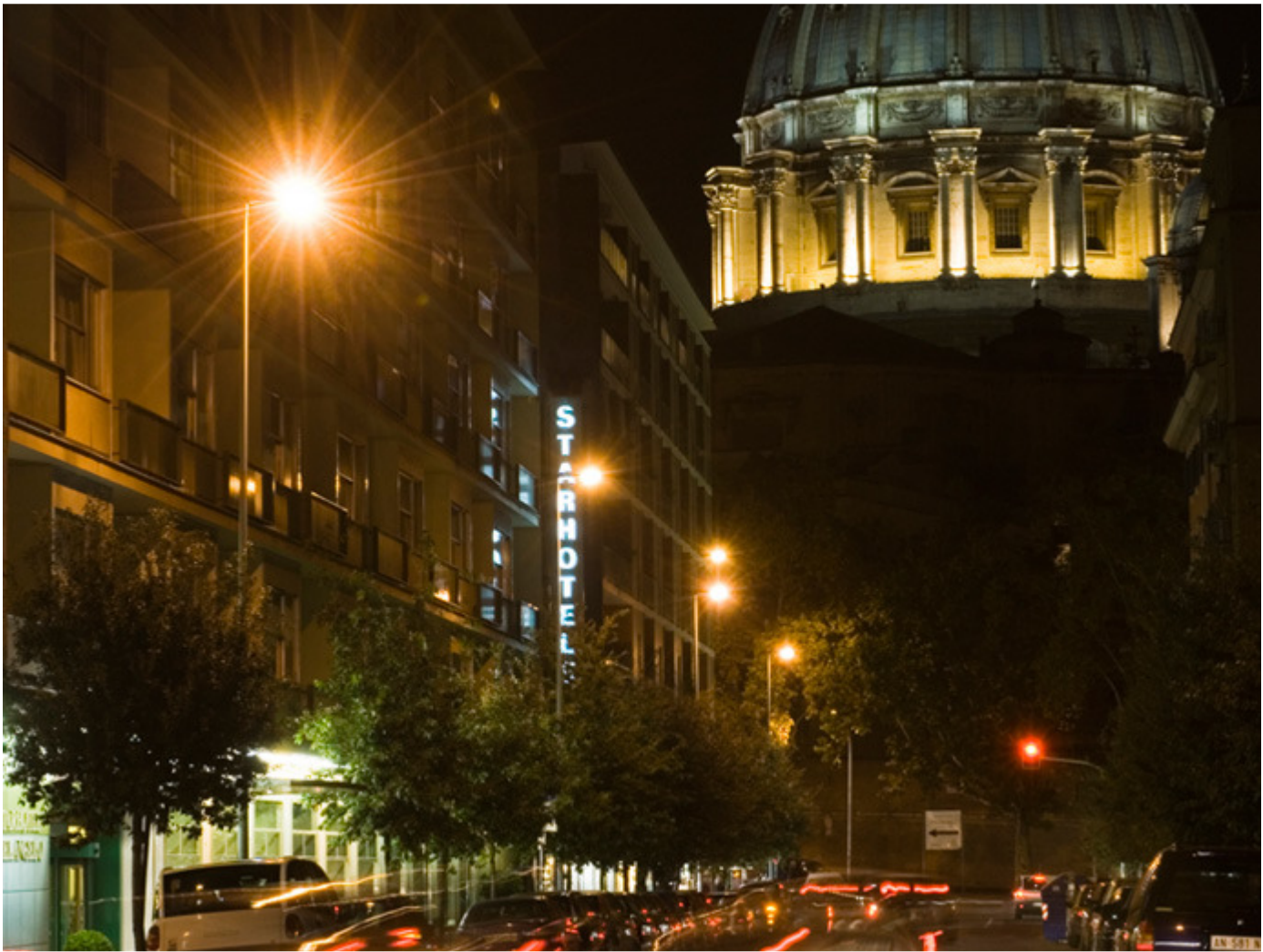
Our hotel in the HEART of Florence – a perfect location!