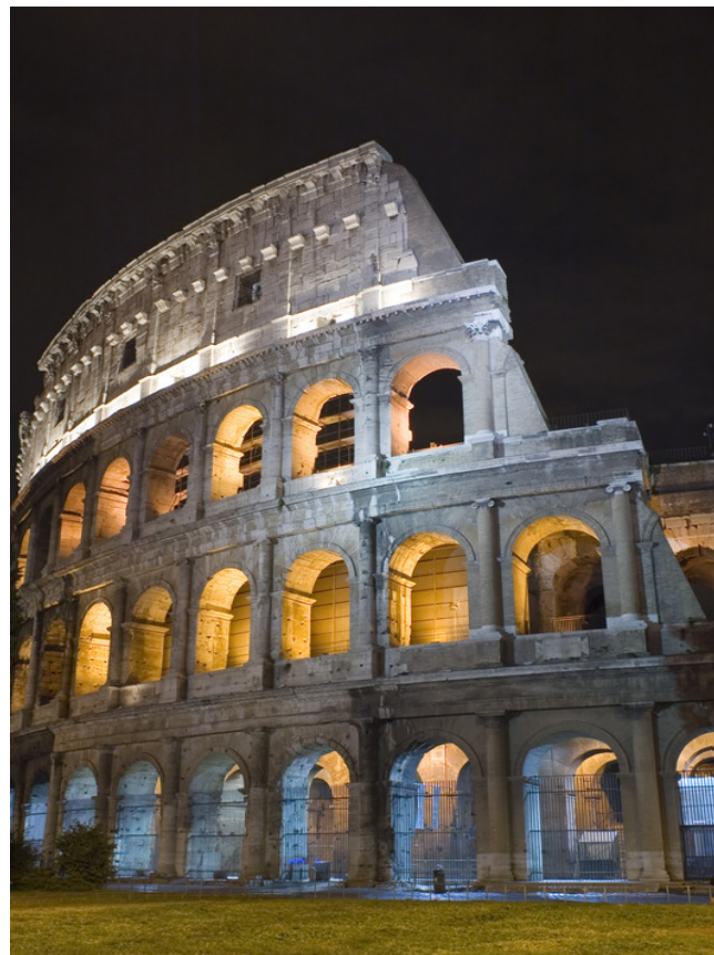
The Impressive Coliseum in Rome

A valid passport is required for this tour