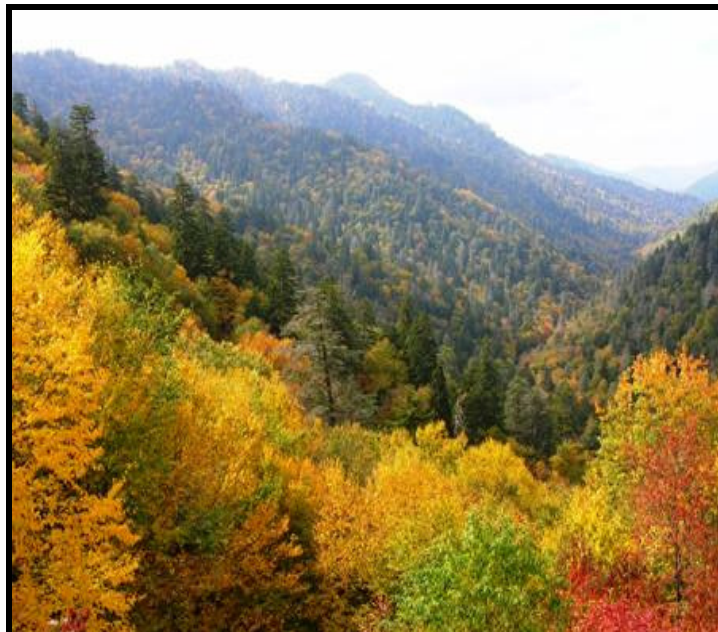
Smoky Mountain National Park near Pigeon Forge

Tips for baggage handling, taxes and hotel gratuities