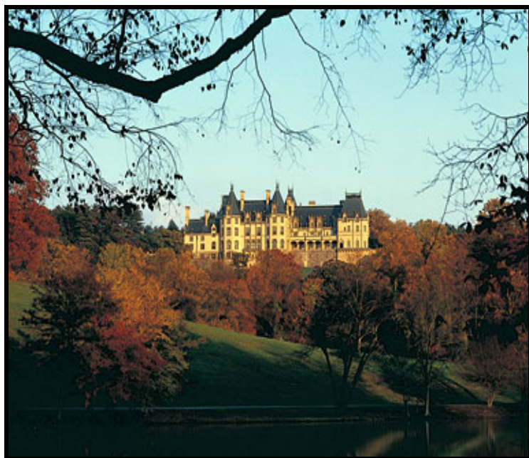
The Grand Biltmore Estate in Asheville, North Carolina